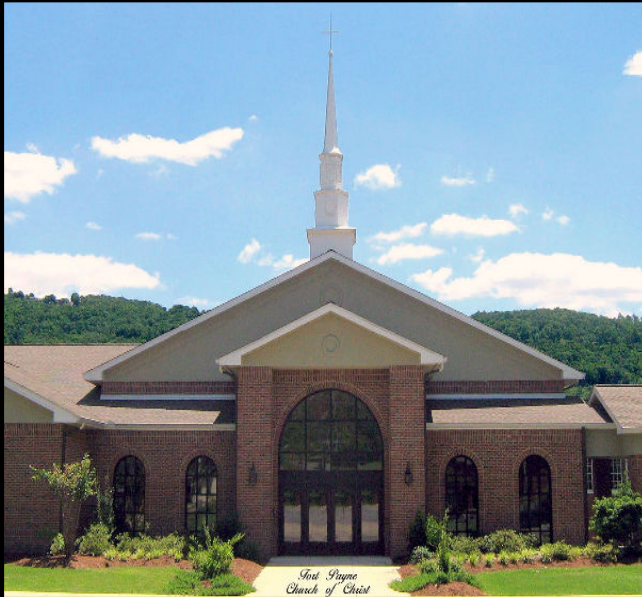
Fort Payne Church of Christ