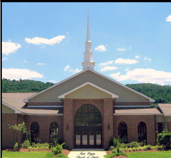
Fort Payne Church of Christ